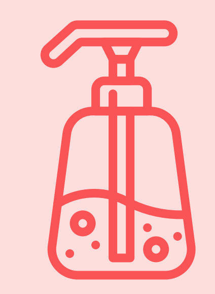
We provide a mask and you will need to sanitise your hands.